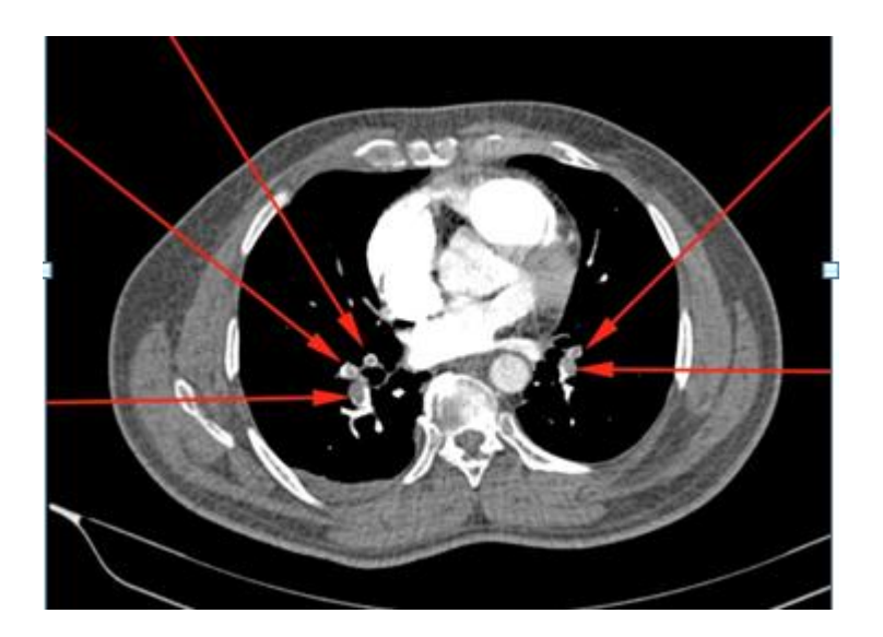
Fig 6. CTPA –Axial Focal central filling defects involving the lower interlobar divisions of both right & left pulmonary arteries