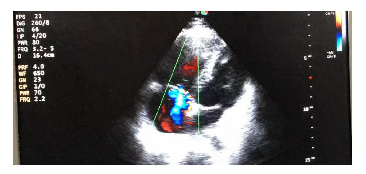
Fig 2- Trans thoracic ECHO

Apical 4 chamber view showing the dilatation of the right atrium and ventricle with tricuspid regurgitation jet.