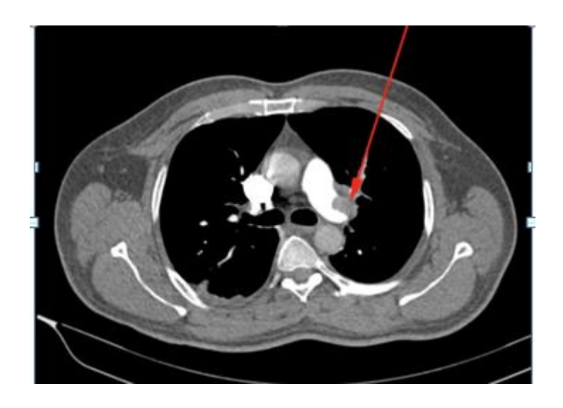
Fig4 CTPA- Axial Eccentric filling defect in the left Pulmonary artery distal to the bifurcation in its proximal portion