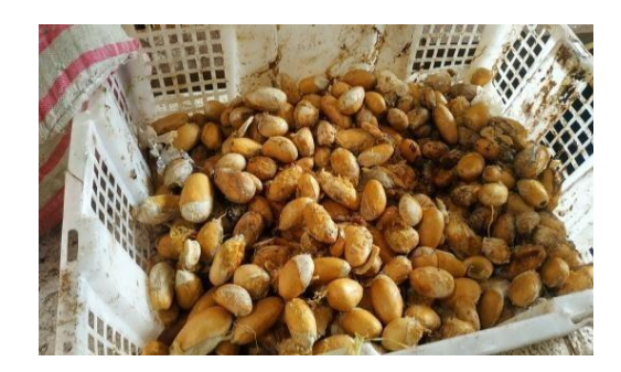
Figure 1. Durian seeds

Durian seeds (Figure 1) are one part of durian that has not been utilized optimally. Until now, the use of durian seeds has only been used as poultry feed and as superior seeds for the durian itself. However, despite the fact that durian seeds have not yet been utilized, they can be processed into alternative food ingredients such as flour which contains quite high content with a complete composition.