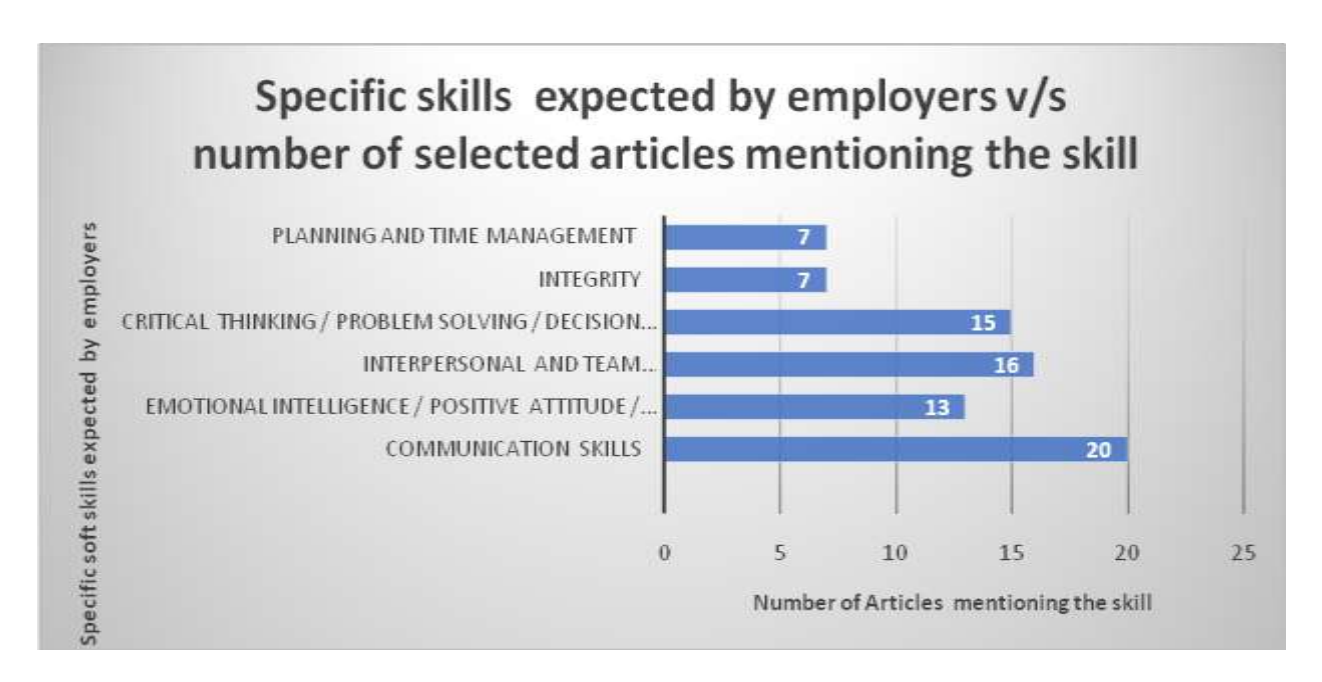
Figure 5: Specific soft skills as expected by employers in Industry

The most soughtafter soft skills by employees are as mentioned in Figure 5