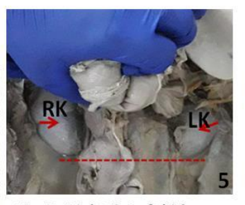
Fig. 5. Right & Left kidney (red arrow). The right kidney is little higher in the level than the left kidney.