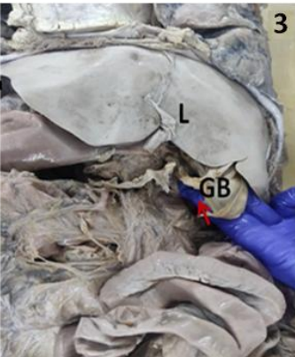
Fig. 3 Presence of liver and gall bladder (red arrow) on the left side