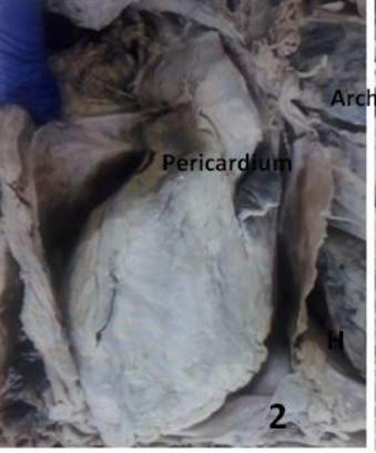
Fig. 2 Showing the apex of the heart (A.H)on the right side after cutting the A.H pericardium. Arch of aorta is also visible. H- heart; Arch- Arch of aorta.