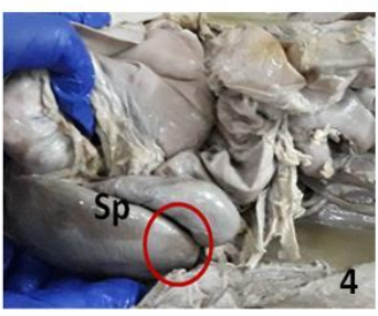
Fig. 4 Enlarged bilobed (red circle) spleen on the right side