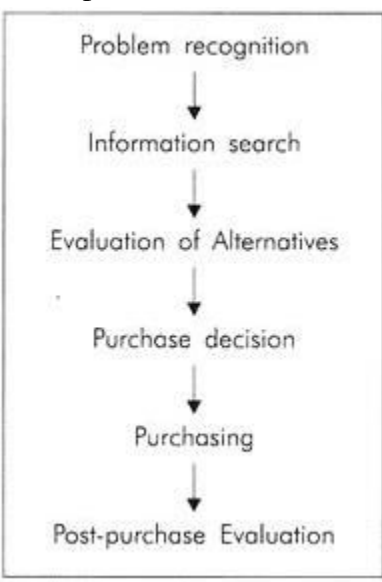
Figure 1: Six stages to the Consumer Buying Decision Process

There are 6 stages to the "Consumer Buying Decision Process" (for complex decisions). "Actual purchasing" is the only one stage of the process. Not all decision processes lead to a purchase.