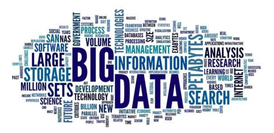
Figure 3. Word cloud representation.

For this purpose, we use word cloud as a means for representing the key words from the above classified tweets. In this technique, maximum number of used words are displayed in bigger size and least occurring one in the tiny size.