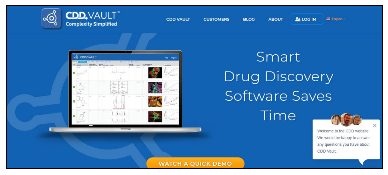
Fig2 - Represents CDD TB.

It is a software designed for small molecular compound libraries analysed towards mycobacterium tuberculosis (Fig 2). CDD have combined around 15 public databases on mycobacterium tuberculosis particular datasets that shows 300000 compounds which is originated from patent, literature, journals, etc [8]. it also has the facilities of storing and sharing data which are private. CDD database is helpful in finding similar compounds and molecular properties to known mycobacterium tuberculosis drugs, and to build unique computational machine learning and pharmacophore models for the identification of potential inhibitors [9-10].