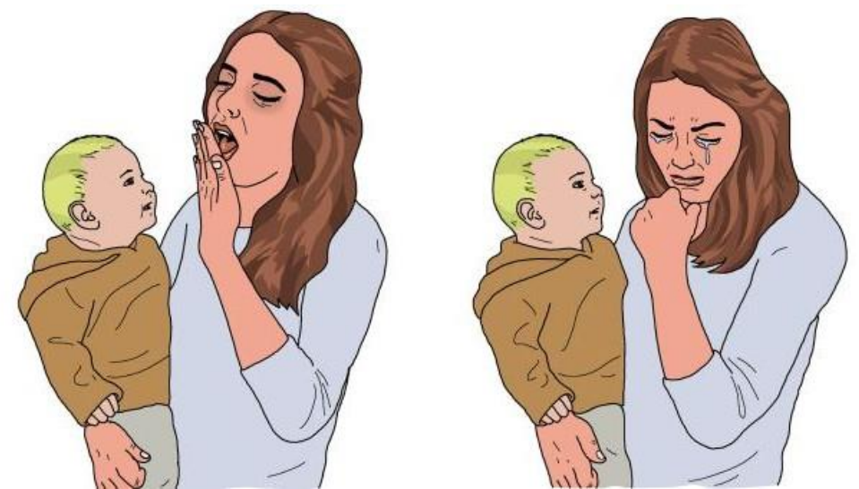
Fig. 1 Sleep deprivation vs postnatal depression

history of attack have increased their auto-reported symptoms during pregnancy[3]. In the majority of these studies a particular correlation was identified and other psycho-social factors such as the existence of pre-existing depression or the presence of stressors in pregnant women were not examined.