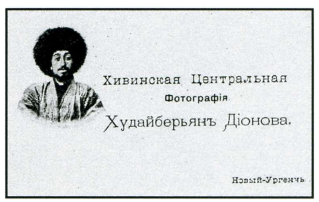
Fig. 3. The business card of H. Devanov

Since 1903, Khudaibergan independently photographed both the Khiva minarets and their contemporaries, carefully navigating the sky without blue clouds.