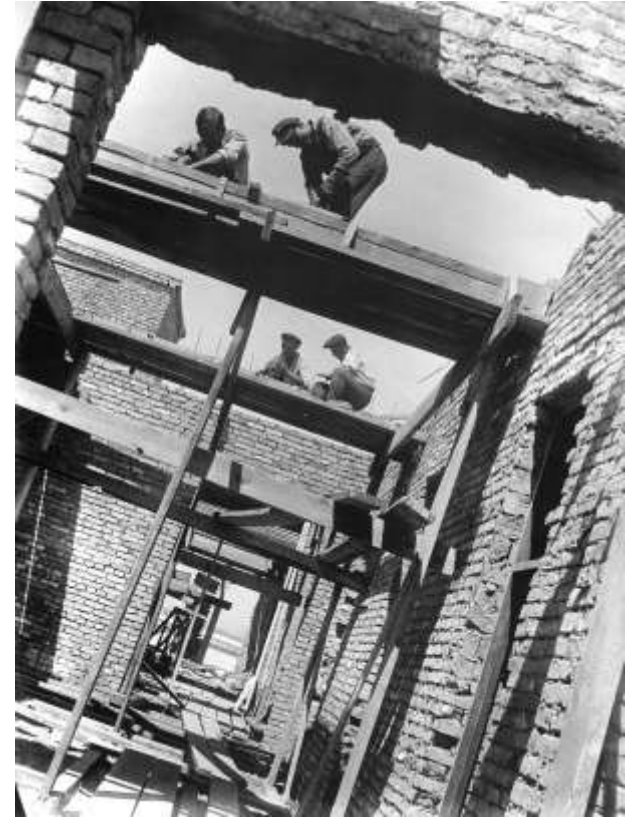
Fig. 8. A. Fedorov. Chirchikstroy. 1934

Market conditions today led to the fact that in Uzbekistan genre photography is not very popular, which generally reduces its level. At the same time, there is a great demand for wedding, staged and other photos that have little to do with the true purpose of the photo, its documentary.