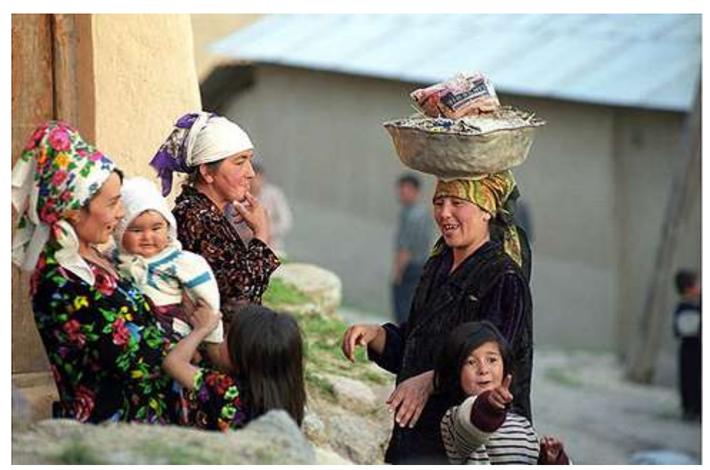
Fig. 9. L. Kudreiko. Photo from the Sukok series.

Market conditions today led to the fact that in Uzbekistan genre photography is not very popular, which generally reduces its level. At the same time, there is a great demand for wedding, staged and other photos that have little to do with the true purpose of the photo, its documentary.