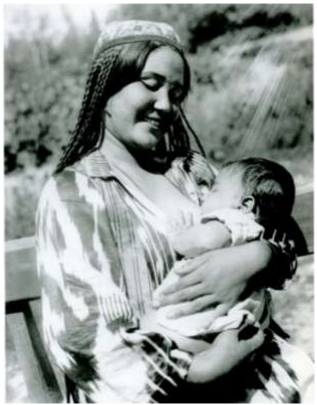
Fig. 6. M. Penson. Uzbek Madonna. 1934

Filming in the Soviet period of history, socially determined custom stories, many Uzbek photographers manifest themselves as original photo-painters and photo-graphics, choosing expressive angles for shooting, presenting such an expressive play of light and shadow that banal shooting lenses (bridges, factory shops, building structures, etc.) gained the self-sufficiency of the artistic image.