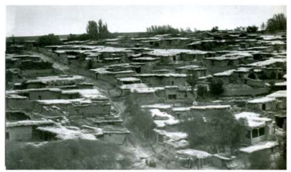
Fig. 5. View of the village of Chashmaboshi. 1870 Author H.H.Devanov

In 1937, H. Devanov repressed, sent to a political prison camp in Yangiyul, where he died. So an outstanding person, the creator of the photo-film chronicles of his land, tragically ended his life ... In 1958, Khudaibergan Devanov was rehabilitated. He left behind a wealth of footage, most of which was destroyed after his arrest. However, something saved. Part of the archive is stored in TsGAKFFD in the city of Krasnogorsk. Unique materials are also still in the Devanov family archive in the city of Urgench. This is a large number of photographs of the beginning of the century, glass negatives, film albums, photo albums, correspondence and an amazingly preserved relic - the Pate Freres camera No. 593, which H. Devanov himself worked with, having shot more than a thousand meters of film.