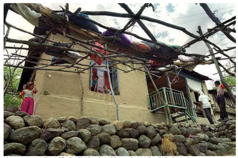
Fig. 12. L. Kudreiko, Photo from the Sukok series.

In general, there is no single structure that really to support professional photographers in Uzbekistan. The Tashkent House of Photography is probably one of the few places where anything happens, but the structure is mostly amateur. Today, certain circles in Tashkent take part in international photography and international exhibitions where information about these exhibitions is available only on the Internet.