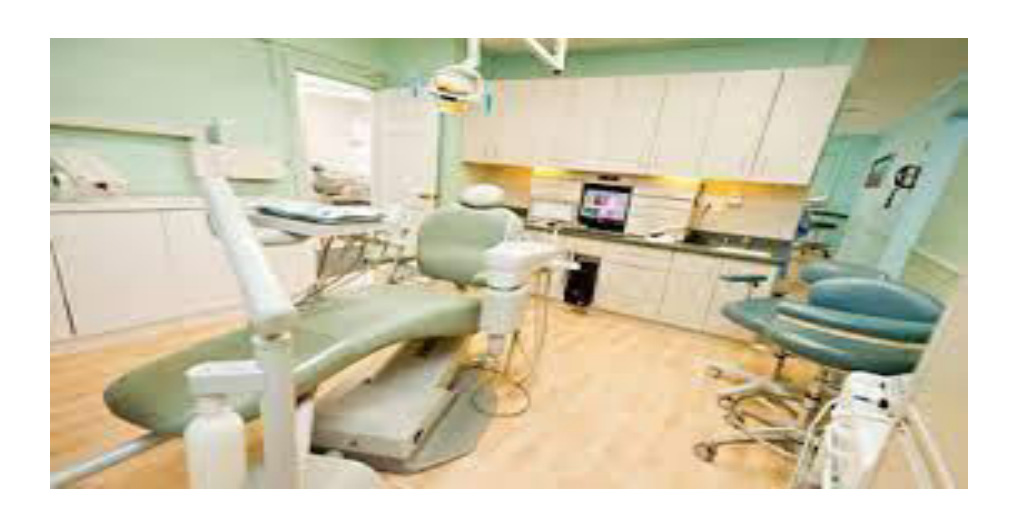
Fig. 1: examination room.

promoting stress in orthodontics need been inward [C]. Keeping patients furthermore groups educated regarding medication progress, indicating cordiality Furthermore concern will all, running your plan looking into time, What's more paying prompt thoughtfulness regarding emergencies need aid every one cosset compelling routes on make the act of a senior orthodontist. air to which those act will develop. Everybody is additionally captivated clinched alongside some structure of advertising should referral sources [D]. Being a fit orthodontist doesn't guarantee the orthodontist of money related prosperity. Making an certified inclination or pride in the office on the and only both specialist Furthermore staff, will help make An attractive field that pull in patients Furthermore alluding dentists [E]. This article will help those recently passed crazy graduate What's more working on orthodontist to dealing with his/her facility ,what's more comprehending at whatever issues which emerge in every day act. Those atmosphere and outline of the facility may be a critical calculate in the triumph from claiming whatever act. That banquet hall and gathering work area aggravate a prompt effect on the new patient's passage under that act. An safe place for both folks Furthermore patients, who are frequently all the on edge around those beginning examination [F]. That examination room will be generally the following venture in the introduction transform (Figure 1).