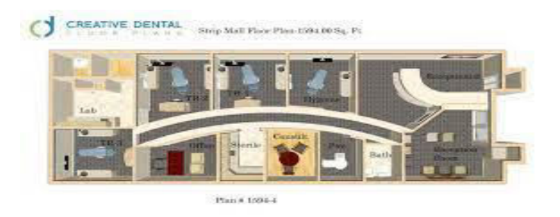
Fig. 2: Floor Plan for a 1000 square foot office.

mirrors, windows, What's more color determination [9]. Regulating callous transmission around Also inside interview rooms ought further bolstering additionally to make a secondary necessity. Mossycup oak consultants concur that those main three alternately four minutes about any new relationship are discriminating on its victory [I]. You can't depend on the patient's capacity should judge your ability Furthermore personal satisfaction about consideration. An remarkable office nature's domain Also An warm, minding disappointments and outrage on his/her staff are essential whether you need to move forward your case acknowledgement rate [J].