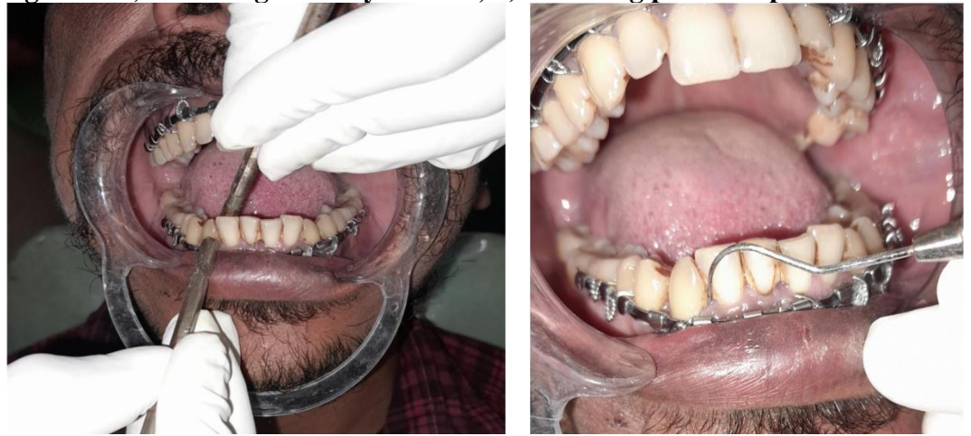
Figure 2- a) Checking mobility of teeth, b) Checking pocket depth