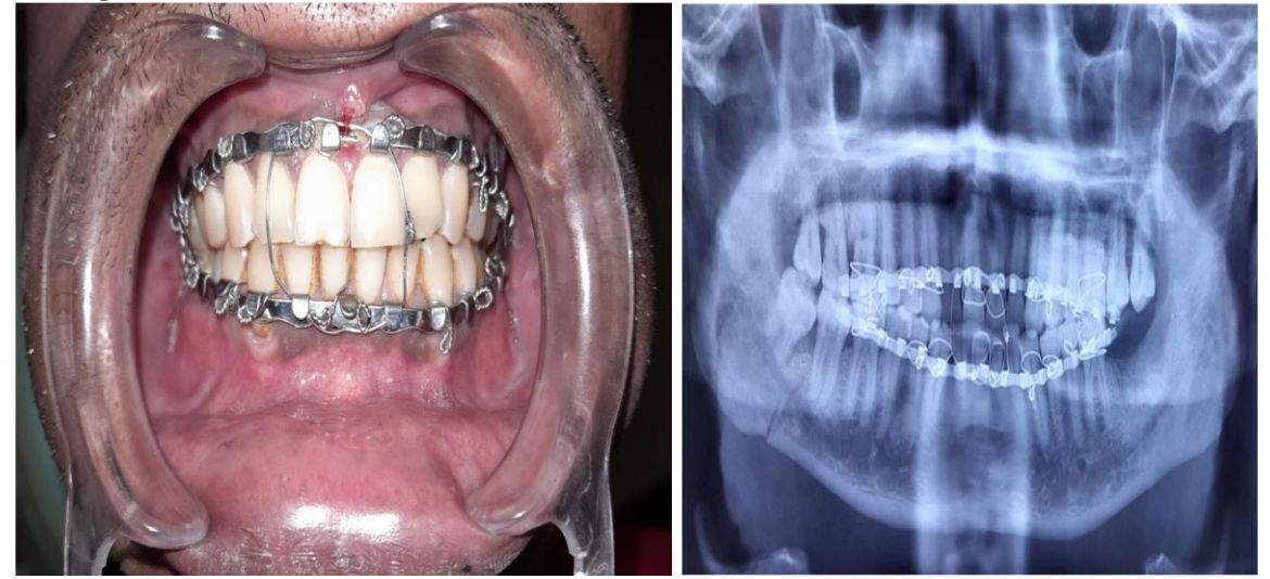
Figure 1: a) Maxillary and Mandibular arch –bar with intermaxillary fixation, b) OPG showing closed reduction with erich arch bar

Of the 59 patients, there were 38 male (64.4%) and 21 female (35.6%) patients. A total of 59 fracture sites were encountered, with the most frequent fracture site being in the mandibular parasymphysis and body region (n=20) followed by mandibular symphysis (n=15), dentoalveolar region (n=4).