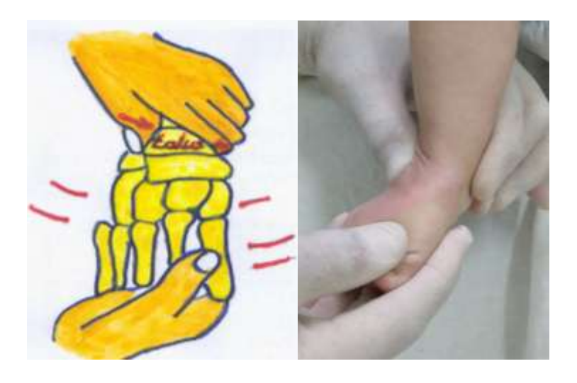
Fig. 1. The technique of plaster bandage application.

Some authors up to the age of one-month use bandage according to Fink-Ettingin-Zelenin (Sviridova O.P., Lukash Yu. 2005) and other modifications of soft bandages (Chugui E.V., 2009). The "Francis" method based on the functional treatment of congenital clubfoot consists in the use of long corrective manipulations and foot exercises aimed at tissue stretching and correction without additional fixation (Benshanel H., Jehanno P., DelabyJ. P., et al., 2006; dimeglioA., Canavese F., 2012). We started the treatment after the baby was discharged from the maternity hospital, with a gentle massage. Parents were taught how to do it. For younger children (from two weeks of age) without other pathologies, the treatment began by applying corrective stage plaster bandages on the lower extremities from the fingertips to the upper third of the thigh [8]. Before the plaster cast is applied, a corrective manipulation of the middle and posterior parts of the foot is performed for 3-4 minutes to bring the foot out of the inversion position. During the plaster cast, the assistant should hold two or three fingers of the child's foot by the fingers in the rare position and apply pressure on the head of the talus [2].