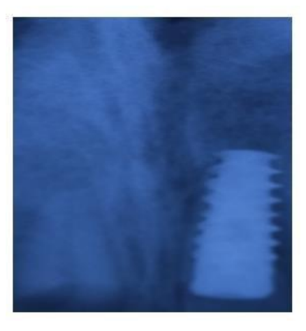
Figure 2. Intraoral Periapical Radiograph