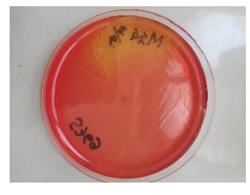
Fig. 2 Staphylococcus aureus Colony on Manitol Salt Agar Medium

In this study, Staphylococcus aureus on Mannitol Salt Agar (MSA) media seen as a yellow colony growth surrounded by a golden yellow zone due to the ability to ferment mannitol to be acid. The product produced by this bacteria is an organic acid which changes the pH indicator in Mannitol Salt Agar, changing the red color of the Mannitol Salt Agar medium to bright yellow ( Rahmi et al, 2015; Ashraf et al., 2020 ). This is in accordance with Dewi's research in 2013, which carried out the isolation and identification of Staphylococcus aureus bacteria, which was marked by the occurrence of mannitol fermentation on Mannitol-Salt agar ( Dewi, 2013 ).