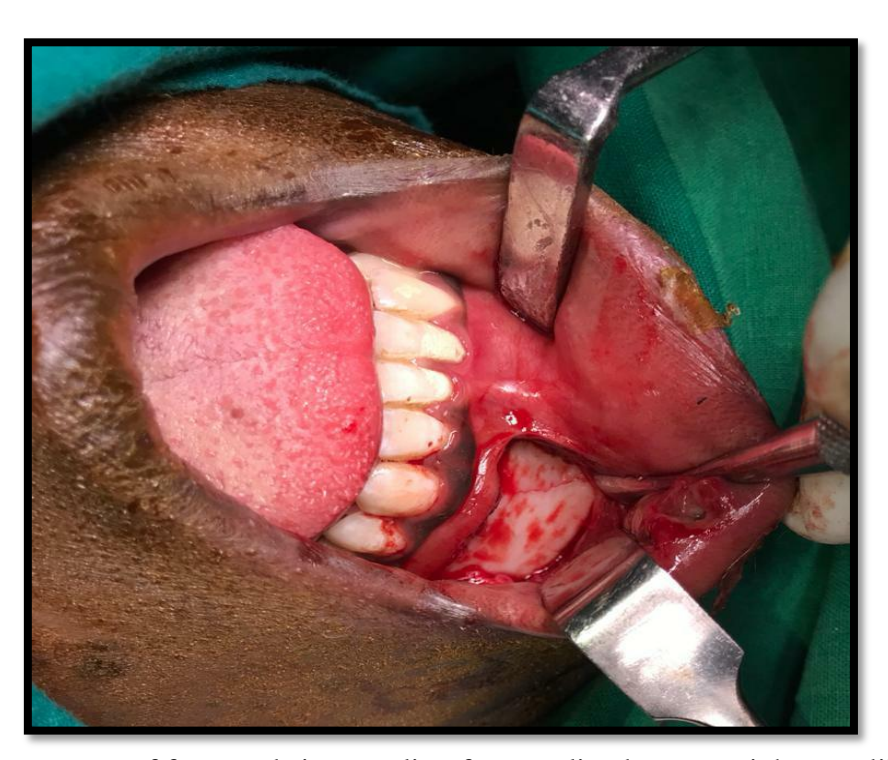
4. Surgical exposure of fractured siterevealing fracture line between right mandibular lateral incisor and canine

3. 3D reconstruction of CBCT revealing parasymphysis fracture