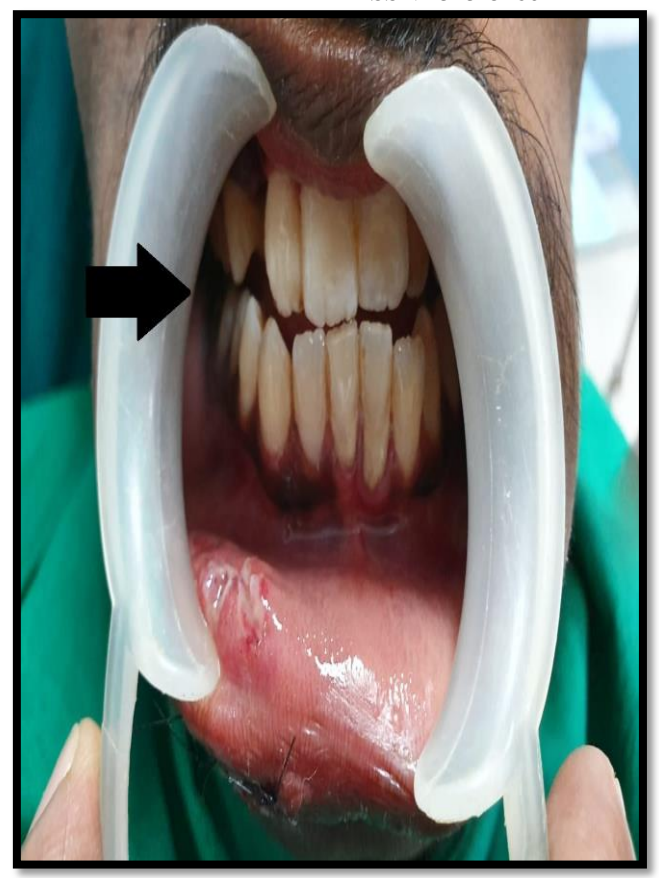
1. Clinical picture along with Deranged Occlusion