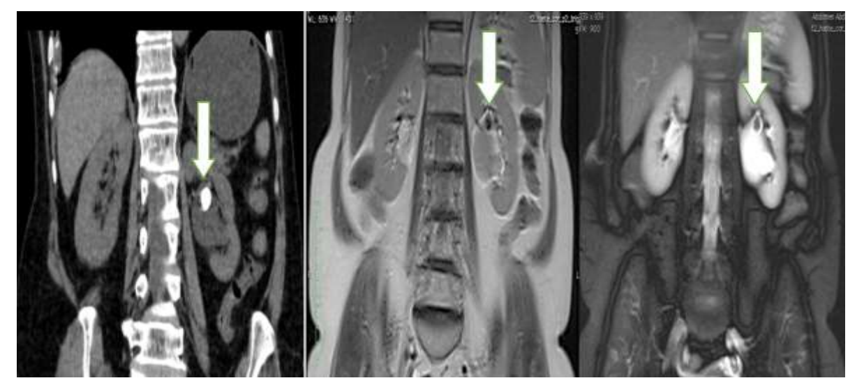
Image 2: Coronal MPR noncontrast CT image (left) shows a small left renal pelvic calculus seen well on Coronal T2W MR image (middle) & Coronal MRU image (right) with large extrarenalpelvis.