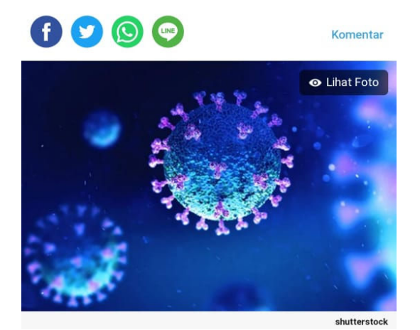
Figure 4 News on On-Line Portal Kompas.com

Since the regulations states that everybody should stay at home during the Covid-19 pandemic, social media and on-line media became two main channels in the crisis management of creative economy of West Bandung. In regard to social media, the forum uses @fekrafkbb, the official Instagram account. The account is a trusted reference for the committee to socialize any information, either policies or the past, ongoing, and future events. In addition, direct message feature of Instagram can be a media for the public, where in this case they are the creative economy players and other stakeholders, to seek information or confirm a thing related to the creative economy sector.